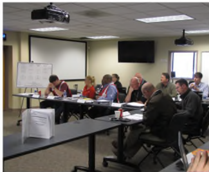
Teamwork '14 Annual LEPC/CEPAC Tabletop Exercise

Franklin County Emergency Management and Homeland Security (FCEM&HS) conducted its annual Local Emergency Planning Committee (LEPC) exercise, Teamwork '14, on April 18, 2014. The tabletop exercise was designed to evaluate implementation of emergency plans and establishment of a unified response with local emergency partners in the event of a hazardous material spill. The exercise was based on a tractor trailer accident resulting in a significant release of Anhydrous Ammonia near a local neighborhood elementary school. The Exercise Evaluation Team and Ohio EMA determined FCEM&HS met all the evaluated objectives. The exercise demonstrated the abilities of each agency to integrate their resources and familiarize each agency's protocols and procedures for response to a hazardous materials incident.