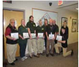
Members of the Franklin County CERT Damage Assessment Specialists

To receive certification, communities must meet certain criteria including education, community outreach, advanced planning and training as well as multiple avenues to receive and distribute severe weather information. NWS reviews the application and conducts a visit to the community to ensure all requirements have been met. FCEM&HS expects to receive certification in early 2015.