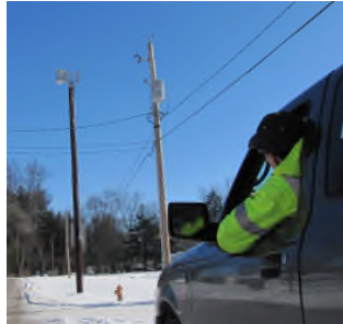
Siren Watch Volunteer monitoring an outdoor warning siren

FCEM&HS Now on Facebook: FCEM&HS launched a Facebook page to communicate with local officials and citizens during emergencies and disasters and share information about emergency preparedness and other emergency management and homeland security topics. Like us at www.facebook.com/fcemhs