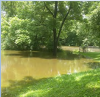
Flooding in Gould Park in June 2014

On June 25, 2014, Gould Park in Columbus and other flood prone areas of Franklin County experienced localized flooding after Central Ohio experienced a large amount of rainfall. Flood Advisories were issued. FCEM&HS activated the Joint Emergency Operations Center (JEOC) and worked with local partners to assess and monitor the situation. FCEM&HS remained in constant contact with officials from Columbus, Gahanna and Whitehall who were impacted by flooding as well as Columbus Department of Public Utilities (DPU) regarding the necessity of a controlled release at Hoover Dam. FCEM&HS alerted Gould Park residents to seek higher ground as flooding was imminent through Code Red (Reverse 911 system) and voice messages through the outdoor warning siren in the area. FCEM&HS developed a programmed evacuation plan to be utilized if it became necessary to evacuate Gould Park.