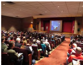
2014 Weather Spotter Training

The National Weather Service (NWS) depends in part on eyewitness information from citizens, public safety and emergency management personnel trained to recognize and report potentially life-threatening severe weather conditions. In March, FCEM&HS in concert with NWS, OSU Emergency Management and the Central Ohio Severe Weather Network (COSWN) conducted the annual Severe Weather Spotter Training at the OSU Fawcett Center. The half-day training seminar educated more than 260 participants on how to spot, report, and prepare for tornadoes and other severe weather.