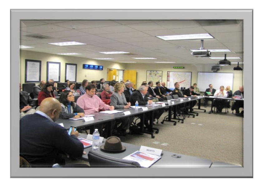
2015 Integrated Risk Management (IRM) Decision Maker Meeting

3<sup>rd</sup> Annual IRM Decision Maker Meeting