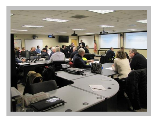
Teamwork '15 Annual LEPC/CEPAC Exercise

Joint Emergency Operations Center (JEOC) operations during Risk Ex'15 Exercise