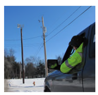
Siren Watch Volunteer monitoring an outdoor warning siren