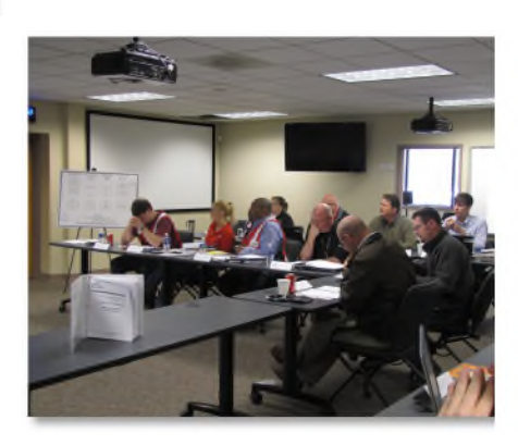
Teamwork '14 Annual LECP/CEPAC Tabletop Exercise

Franklin County Emergency Management and Homeland Security (FCEM&HS) conducted its annual Local Emergency Planning Committee (LEPC) exercise, Teamwork '14, on April 18, 2014. The tabletop exercise was designed to evaluate implementation of emergency plans and establishment of a unified response with local emergency partners in the event of a hazardous material spill. The exercise was based on a tractor trailer accident resulting in a significant release of Anhydrous Ammonia near a local neighborhood elementary school. The Exercise Evaluation Team and Ohio EMA determined FCEM&HS met all the evaluated objectives. The exercise demonstrated the abilities of each agency to integrate their resources and familiarize each agency's protocols and procedures for response to a hazardous materials incident.