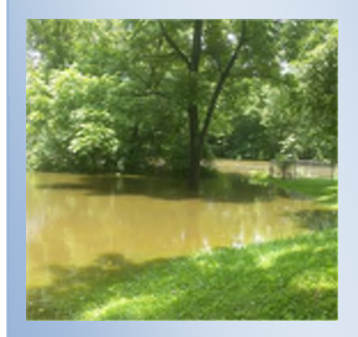
Flooding in Gould Park in June 2014

On June 25, 2014, Gould Park in Columbus and other flood prone areas of Franklin County experienced localized flooding after Central Ohio experienced a large amount of rainfall. Flood Advisories were issued. FCEM&HS activated the Joint Emergency Operations Center (JEOC) and worked with local partners to assess and monitor the situation. FCEM&HS remained in constant contact with officials from Columbus. Gahanna and Whitehall who were impacted by flooding as well as Columbus Department of Public Utilities (DPU) regarding the necessity of a controlled release at Hoover Dam. FCEM&HS alerted Gould Park residents to seek higher ground as flooding was imminent through Code Red (Reverse 911 system) and voice messages through the outdoor warning siren in the area. FCEM&HS developed a programmed evacuation plan to be utilized if it became necessary to evacuate Gould Park.