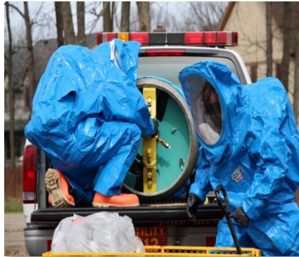
FCEM&HS/CEPAC/LEPC/OEMA/SERC 2013 Full Scale Exercise in April.

The 2013 FCEM&HS/CEPAC/OEMA/SERC 2013 Full Scale Exercise was held on April 4, 2013 to validate Franklin County's Emergency Operations Plan (EOP) and evaluate response plans and capabilities in the event of a domestic terrorist incident. The exercise was based on multiple coordinated terrorist attacks executed concurrently at schools in Westerville and Grandview Heights. The Westerville scene included a HazMat (Chlorine) attack and both locations involved an active shooter situation. Over 200 participants took part in the exercise. The Exercise Evaluation Team determined FCEM&HS met all the evaluated objectives and current systems performed extremely well, providing the foundation for a rapid, controlled response to a disaster.