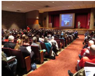
2013 Weather Spotter Training

FCEM&HS urged the community to participate in the annual Statewide Tornado Drill on March 6th, 2013. The Franklin County Outdoor Warning Siren System was activated during a special test. The Agency reached out to more than 1,200 area businesses, schools and agencies in March, urging them to participate in the drill and share their results in an online survey. In 2013, thousands of Franklin County residents participated in the Statewide Tornado Drill. FCEM&HS encourages citizens, schools, and businesses design their own tornado safety plans to respond safely in a real event.