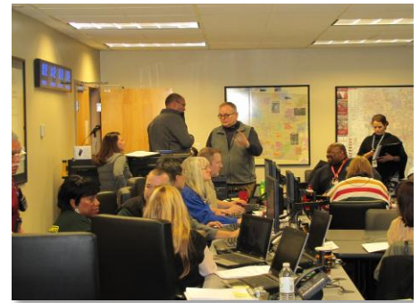
2013 FCEM&HS & Columbus MSA Regional Functional Exercise in November.