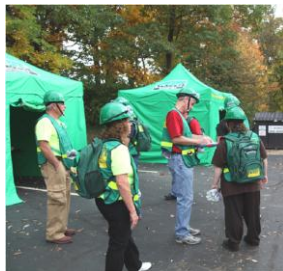
CERT Volunteers Disaster Simulation Training

In 2013, FCEM&HS held four CERT Basic Training classes. Two courses were funded by a Citizen Corp grant to enable local veterans as well as deaf and hard of hearing residents to participate. Over 75,000 veterans reside in Franklin County as well as thousands of residents with functional needs. The training provided them with the basic skills needed to help themselves, their families and their community in a disaster. Franklin County CERT has over 270 graduates of the CERT Basic Training course.