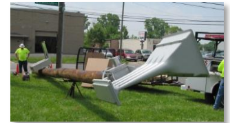
One of 14 new Outdoor Warning Sirens being installed in Franklin County.

Outdoor Warning Siren (OWS) System: FCEM&HS expanded the Franklin County Outdoor Warning Siren System by adding 14 new and two replacement outdoor warning sirens in June 2013. The City of Columbus purchased six new sirens and eight new sirens were funded through an Urban Areas Security Initiative (USAI) grant from the Homeland Security Advisory Committee (HSAC). Franklin County has a total of 195 operational outdoor warning sirens. Four Outdoor Warning Sirens in Reynoldsburg and one in Marble Cliff also received Front Panel Upgrades.